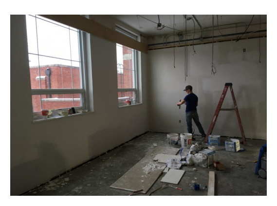
Brown Hall #214 Refresh