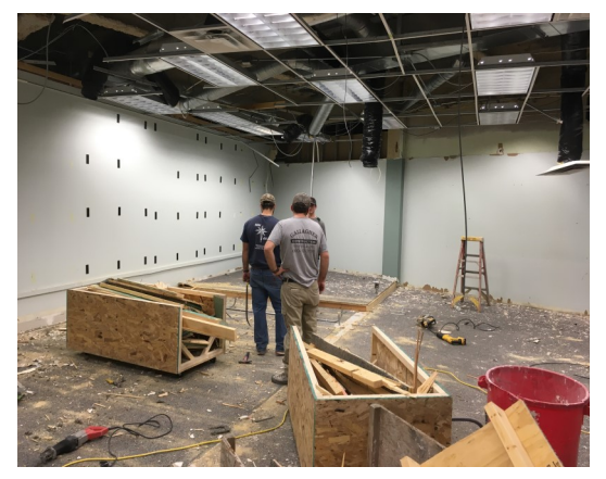
Owens Library #250 Refresh