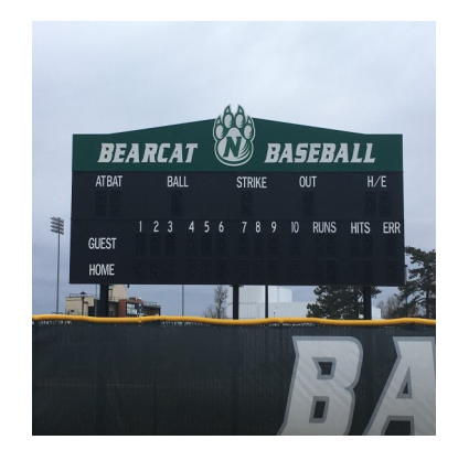
Baseball Scoreboard Branding