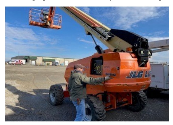
Maintenance & Custodial Boom Lift

Northwest FY20 budget approved the purchases of a few much needed new vehicles and equipment for Facility Services Operations Departments.