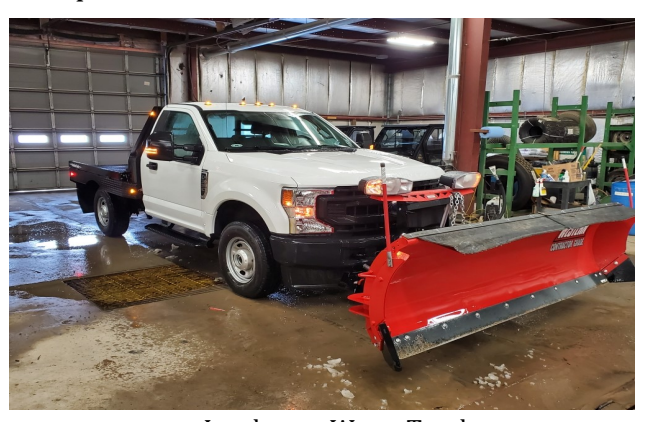
Landscape Water Truck