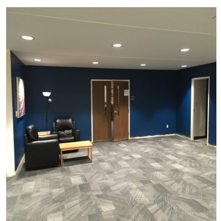
Owens Library Carpet & Paint